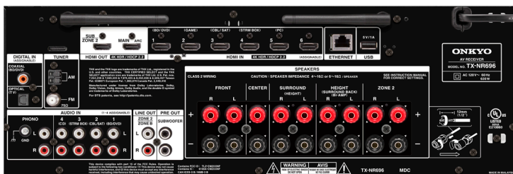
Text on receiver may vary with region.