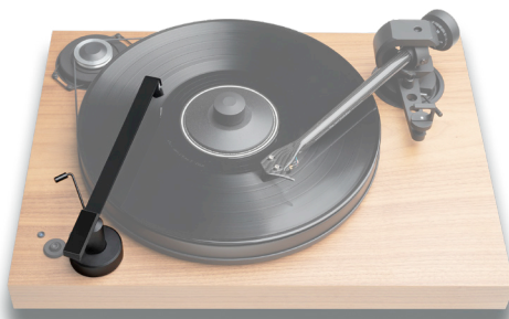
Type 2 Outside motor with speed switch button