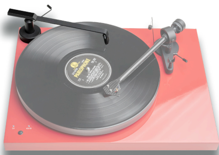
Type 1 Motor under platter

The record broom can be placed in one of two left hand side corners of the turntable. The placement is depending on the type and shape of your turntable. At the optimal position the brush should align with the spindle (i.e. the center of the platter). Deviations (relative to the spindle) between 1,5 to 2 cm are well compensated by design of the Sweep it S2. Higher deviations can cause more drastic skating effects.