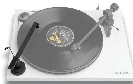
Type 3 Outside motor with or without speed switch button

If there is enough space, the upper left corner is an ideal place for the record broom.