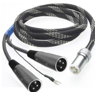
Connect it Phono DS 5P/XLR: separately available upgrade cable for True Balanced phono connections