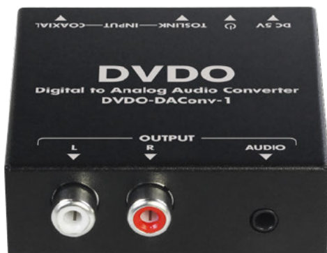
DVDO-DAConv-1 Digital to Analog Audio Converter